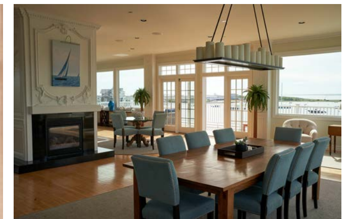
THE ADMIRAL SUITE, WITH MEETING SPACE FOR UP TO EIGHT