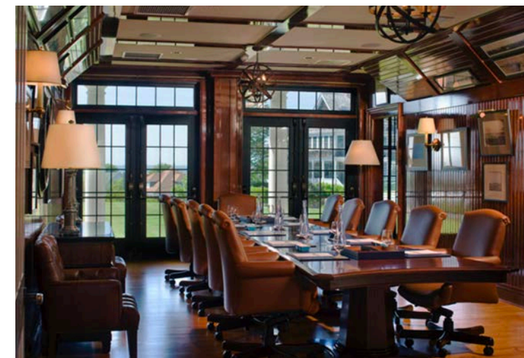
HARBOUR ROOM, OCEAN HOUSE