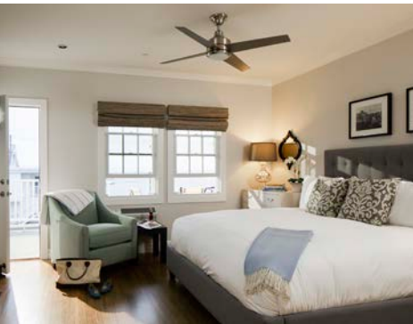
TWO BEDROOM SUITE