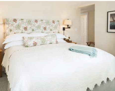
COVE VIEW DELUXE ROOM