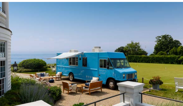
FOOD TRUCK PRIVATE CATERING, OCEAN HOUSE