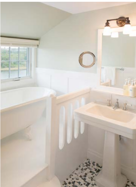
COVE VIEW DELUXE BATHROOM