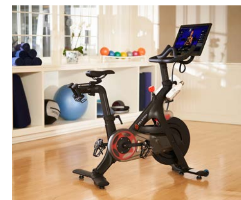
FITNESS CENTER PELOTON, OCEAN HOUSE

The Fitness & Wellness Center offers state-of-the-art cardio machines, strength training equipment and an exercise studio for yoga and Pilates classes led by trained experts. Doors open to the morning sun with vistas across the adjoining deck and 75-foot outdoor lap pool to the Pond beyond.