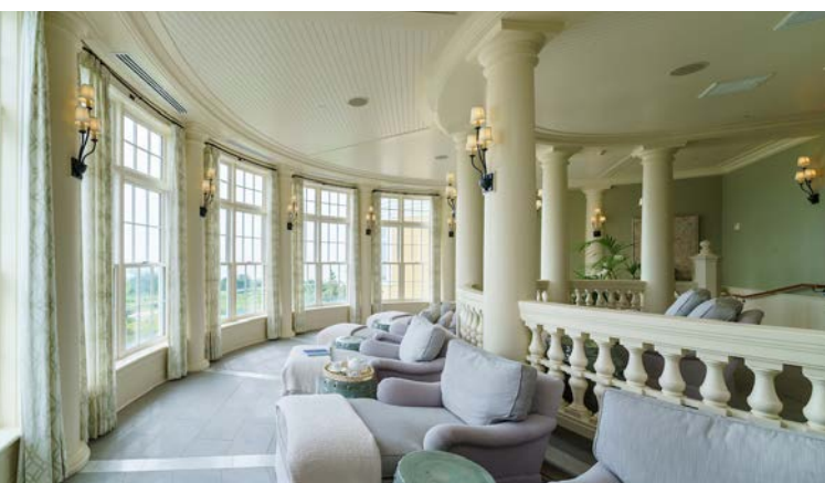
OCEAN & HARVEST SPA RELAXATION ROOM