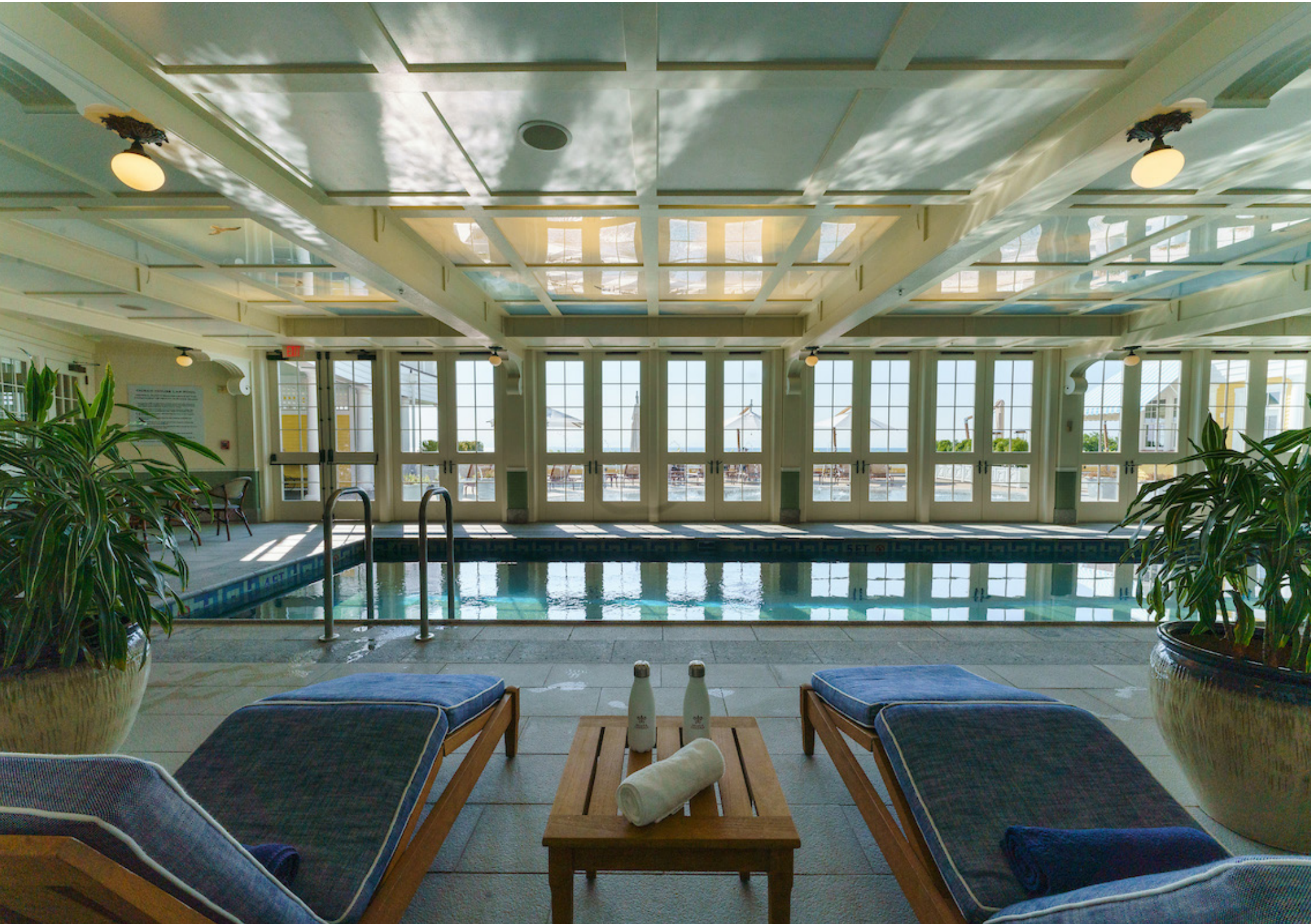
HEATED, INDOOR SALT-WATER LAP POOL, OCEAN HOUSE