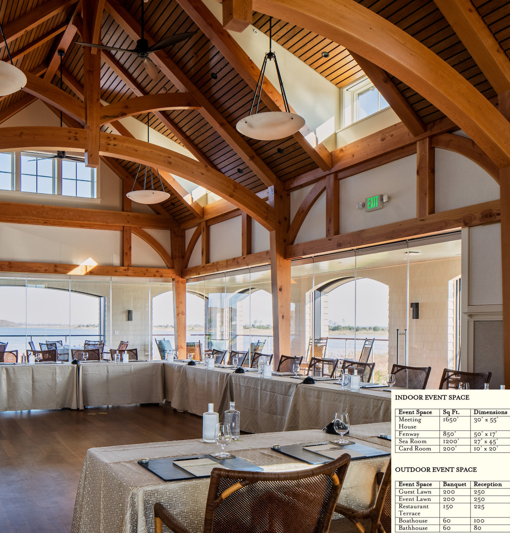
THE MEETINGHOUSE, WEEKAPAUG INN