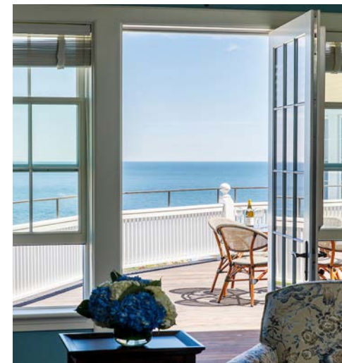
OCEAN VIEW TERRACE SUITE