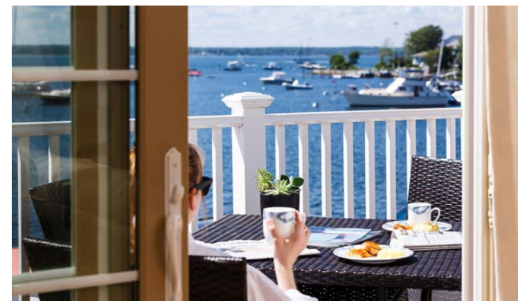
TERRACE VIEWS OF WATCH HILL HARBOR