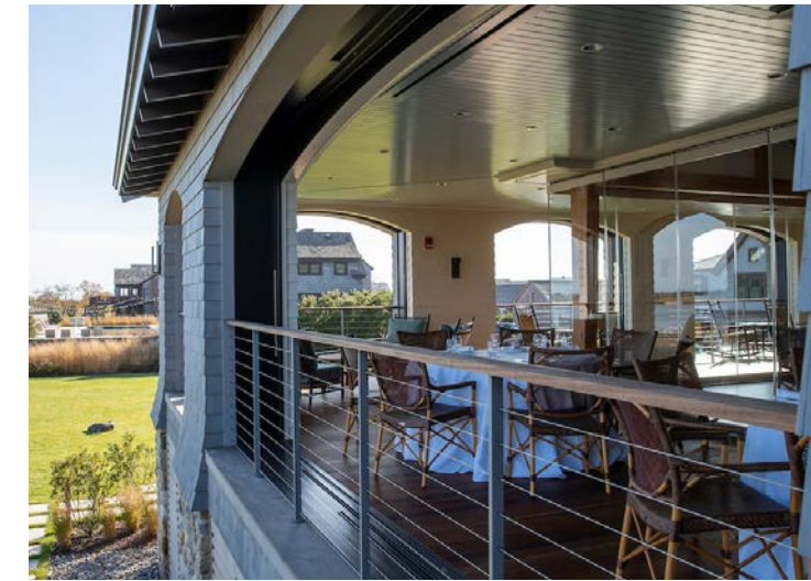
THE MEETINGHOUSE, WEEKAPAU INN

WHETHER FOR A MEETING OF 15 OR A FORMAL DINNER FOR 180, the Ocean House and Weekapaug Inn provide the perfect spaces for any event. Working with our planning professionals, your group will receive a custom event that includes every detail, from catering, accommodations and transportation to scheduling golf tournaments, fishing trips, team-building programs and motivational speakers. Whatever the size and style of your event, we will help you to forge lasting professional bonds.