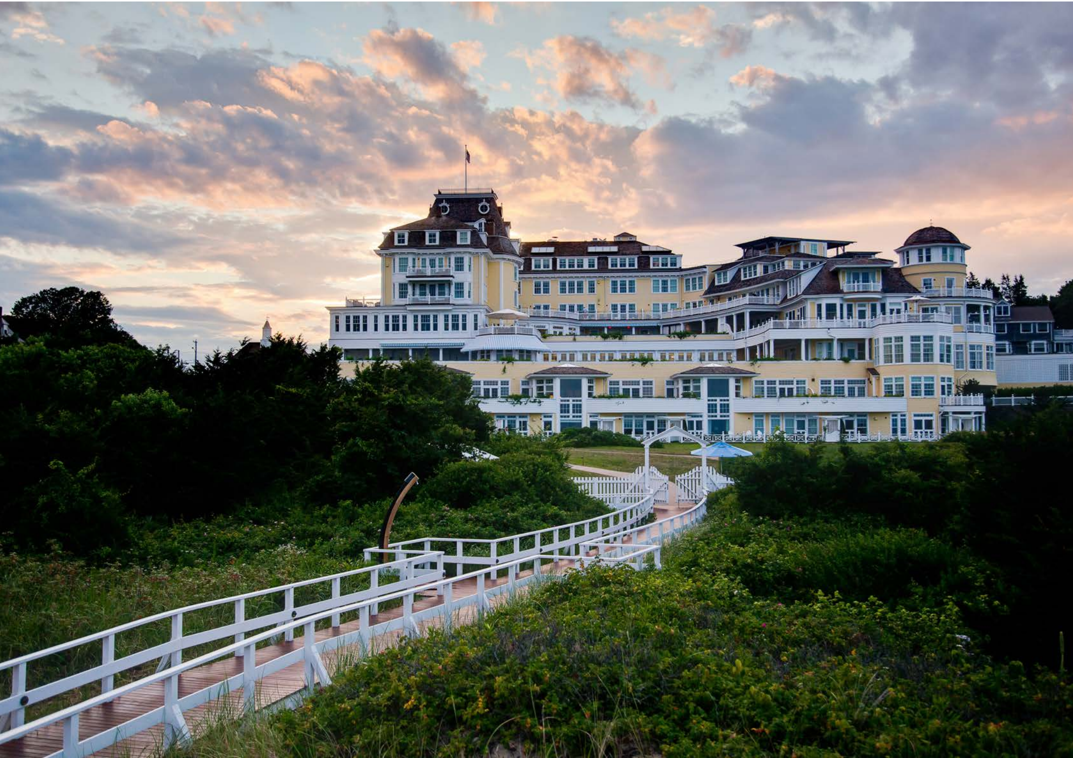
BOARDWALK, OCEAN HOUSE