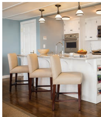
GREAT EGRET SUITE