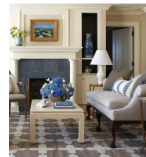
OCEAN BLUFF SUITE