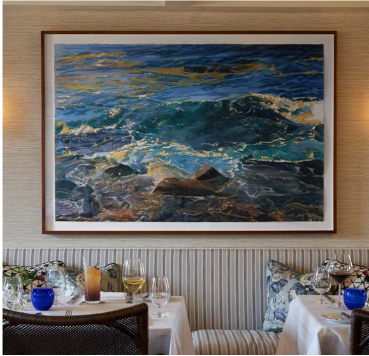
THE RESTAURANT, WEEKAPAUG INN

IN A REGION WHERE THE FRESHEST IN PRODUCE AND SEAFOOD ARE AVAILABLE, guests are treated to classically inspired farm-to-table cuisine of the Atlantic Northeast. Our world-class culinary team utilizes local estate-grown ingredients, organic produce and off-the-boat seafood to create a unique and unforgettable dining experience. Guests select from menus that change weekly, featuring the freshest ingredients from local sources in cuisine that is simple and classic.