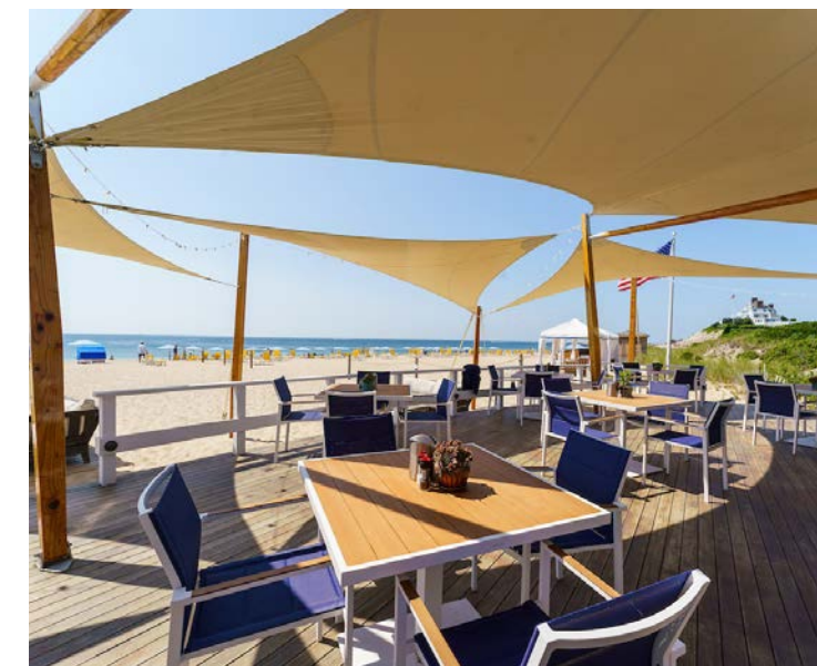
DUNE COTTAGE DECK, OCEAN HOUSE

WHETHER FOR A MEETING OF 15 OR A FORMAL DINNER FOR 180, the Ocean House and Weekapaug Inn provide the perfect spaces for any event. Working with our planning professionals, your group will receive a custom event that includes every detail, from catering, accommodations and transportation to scheduling golf tournaments, fishing trips, team-building programs and motivational speakers. Whatever the size and style of your event, we will help you to forge lasting professional bonds.