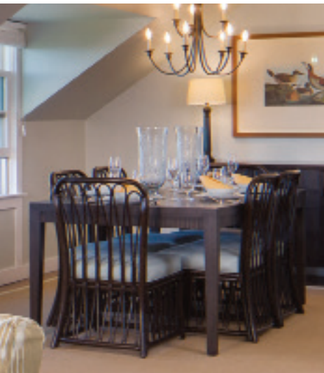
GREEN HERON SUITE