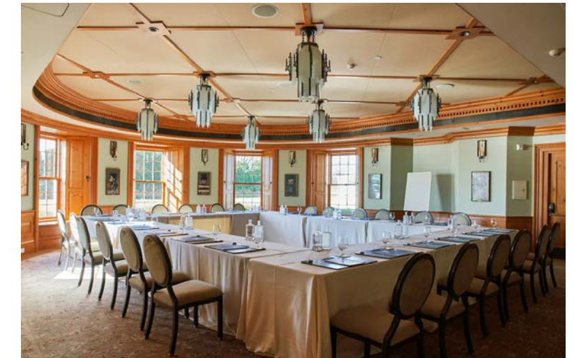
THE DRAWING ROOM, OCEAN HOUSE