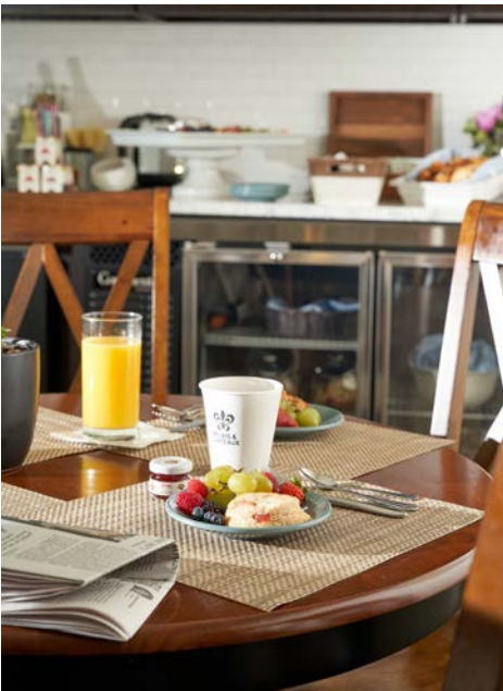
COMPLIMENTARY DAILY CONTINENTAL BREAKFAST