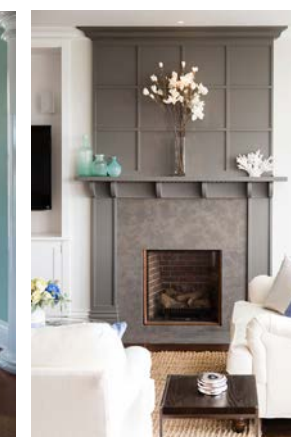
SEA GLASS SUITE