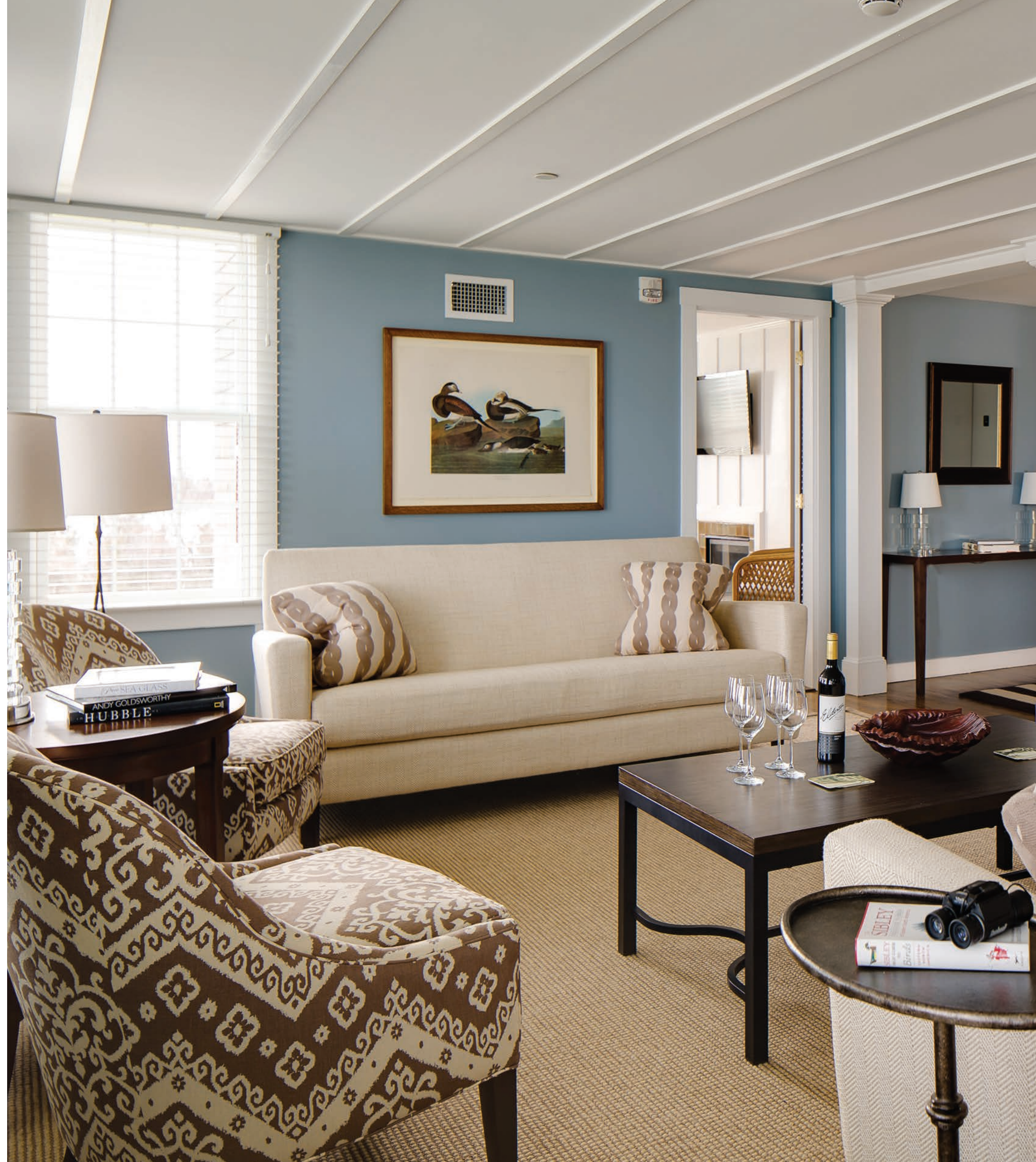
RIGHT: GREAT EGRET SUITE