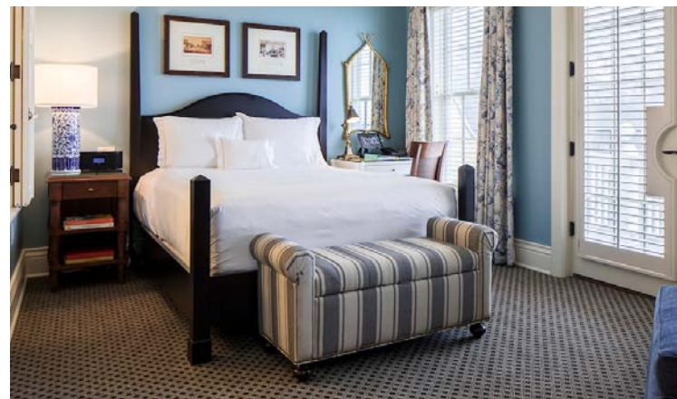
STANDARD QUEEN ROOM