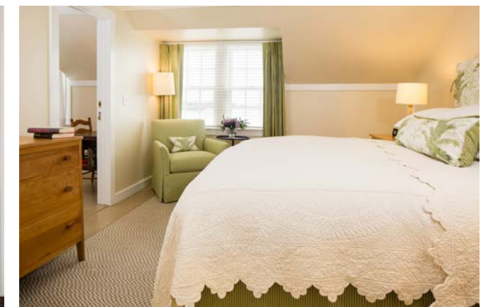
POND VIEW ONE-BEDROOM SUITE