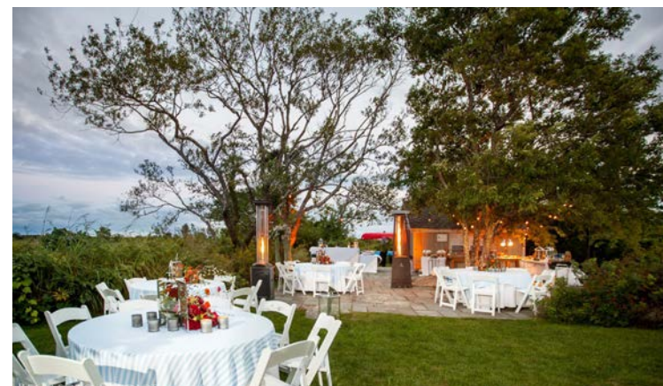
BOATHOUSE, WEEKAPAU INN