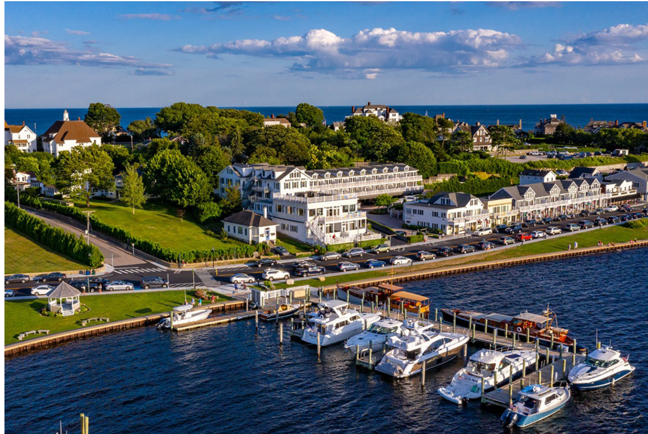
WATCH HILL INN AND WATCH HILL VILLAGE