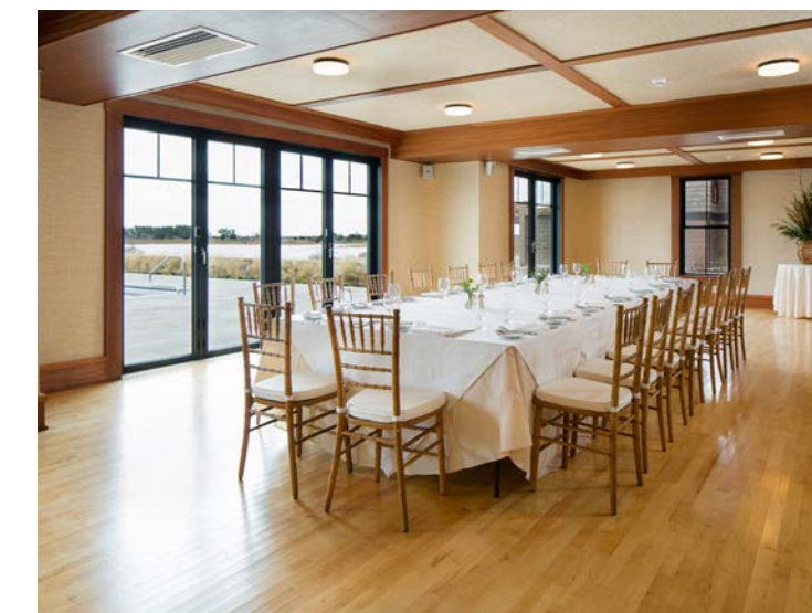
FENWAY, WEEKAPAUG INN

The newest year-round waterfront event space is The Meeting-House, a state-of-the-art event center with enormous floor-to-ceiling windows that face the Pond and the ocean beyond. It is a masterpiece of a gathering space with room for larger meetings, breakout space, and an inviting porch that allows guests to enjoy waterfront breezes during lunch and other breaks.