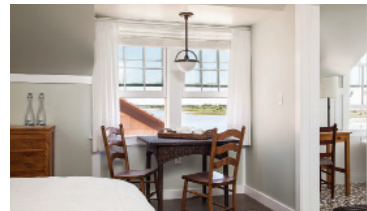
POND VIEW DELUXE ROOM