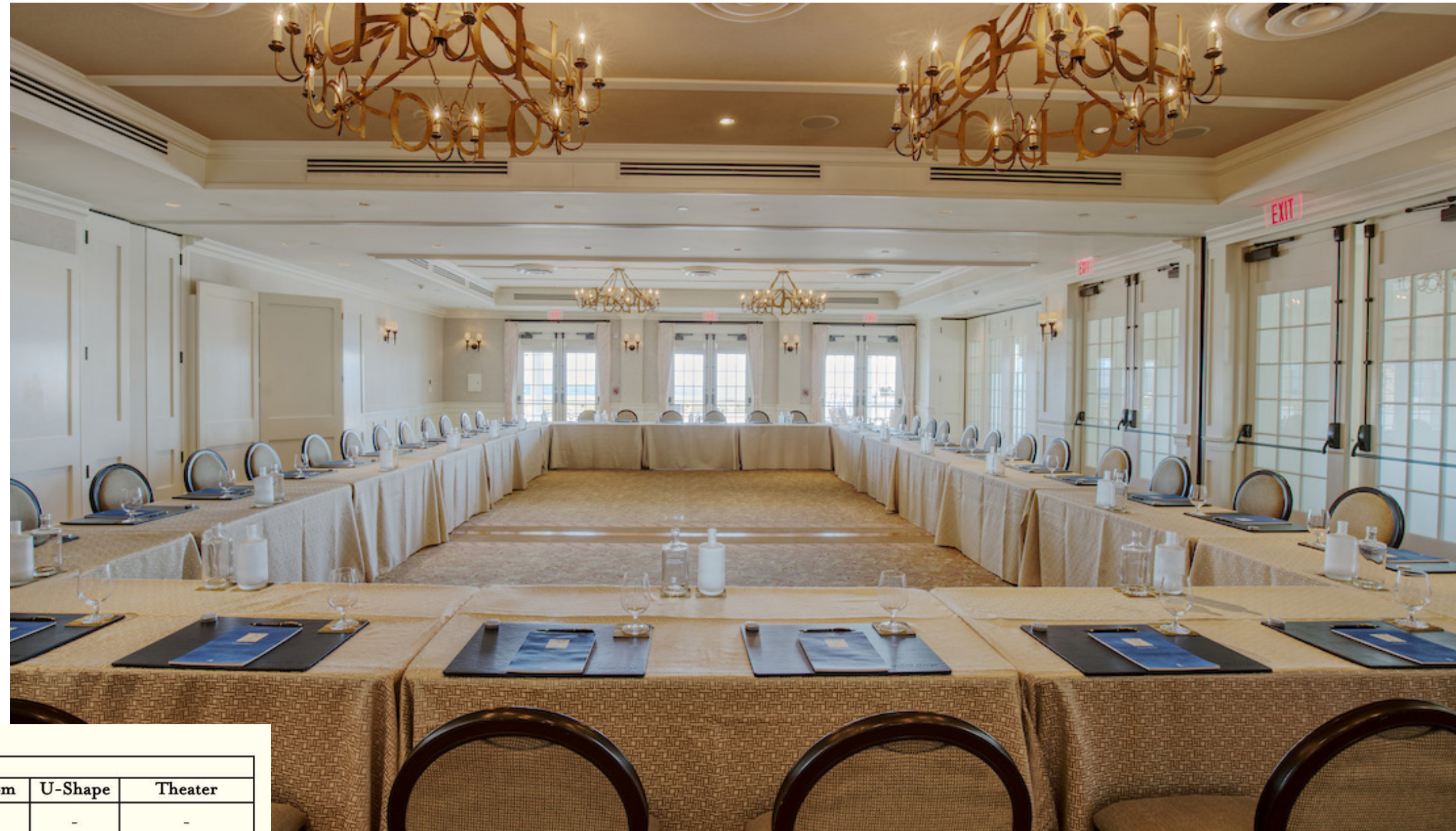
SEASIDE BALLROOM, OCEAN HOUSE