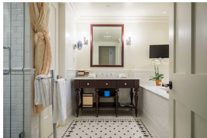
DELUXE KING BATHROOM