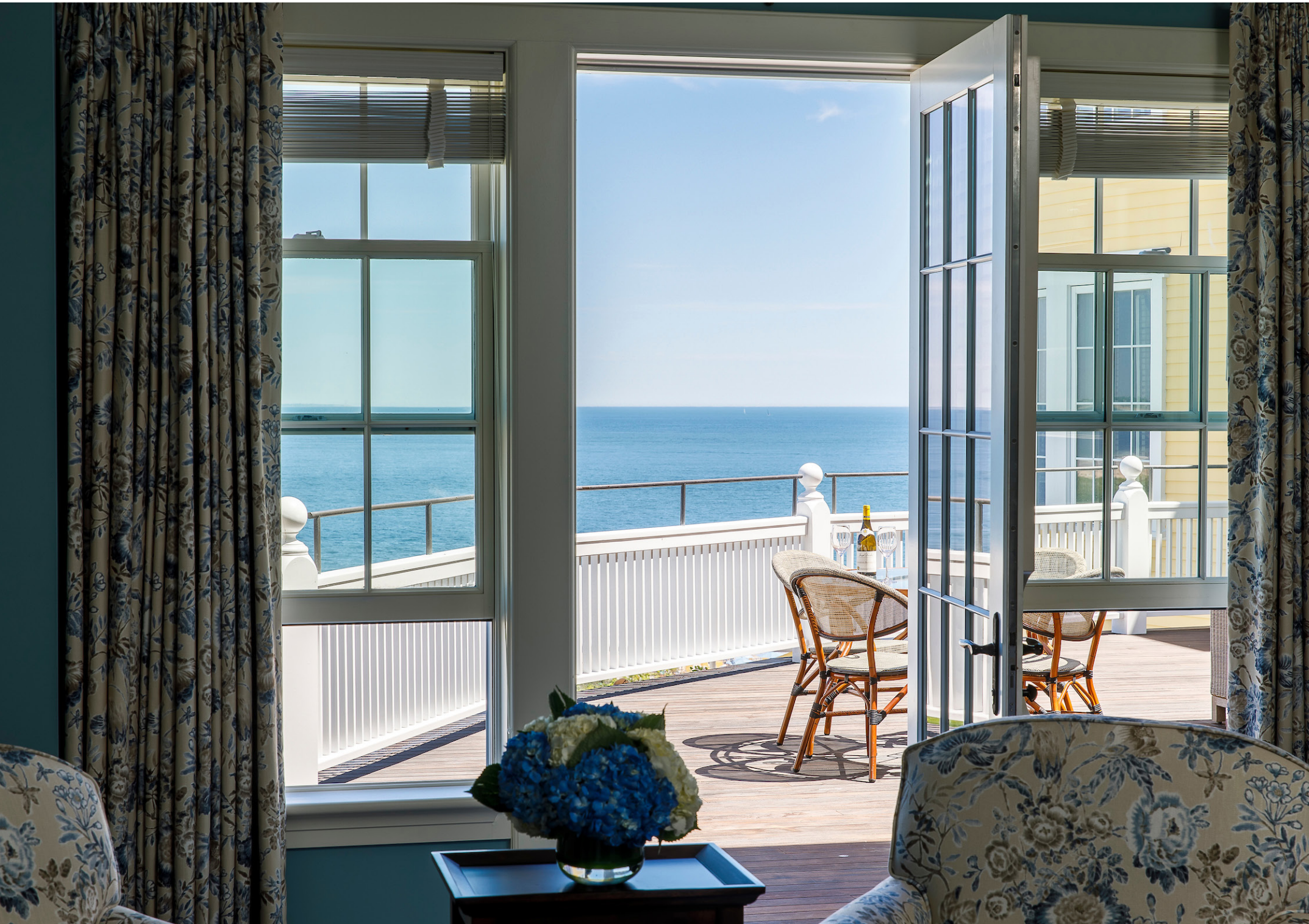
OCEAN VIEW TERRACE SUITE