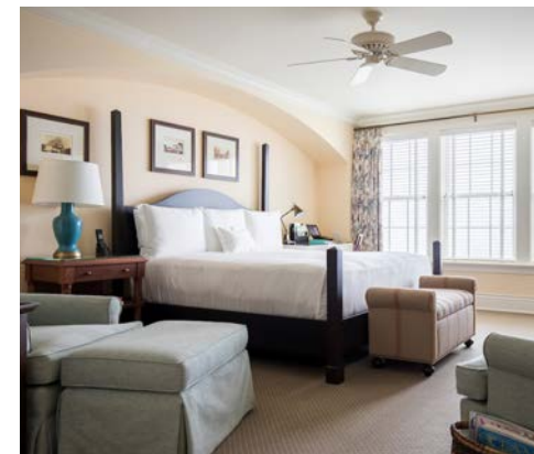
DELUXE KING ROOM