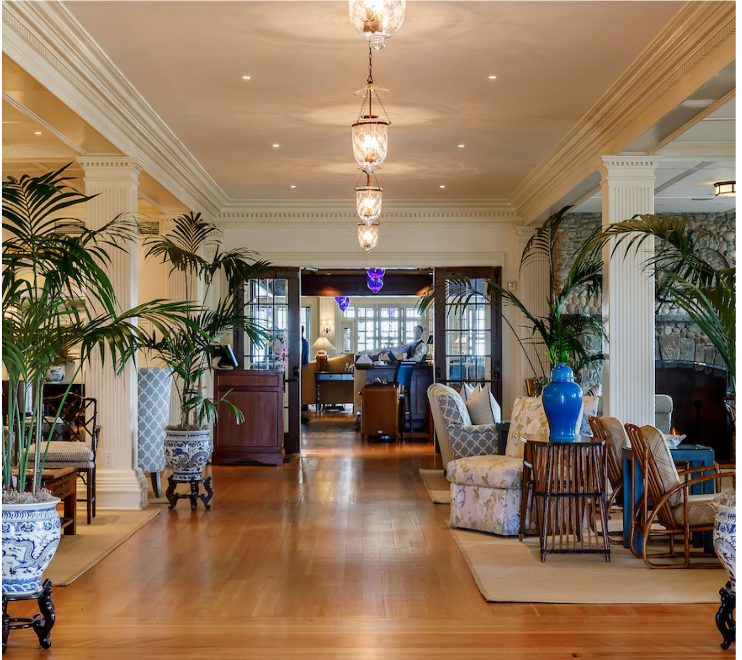
THE LOBBY, OCEAN HOUSE

FROM INTIMATE GATHERINGS TO LARGE CONFERENCES, the Ocean House and Weekapaug Inn offer two different and beautiful seaside New England locations, with distinctive event spaces, elegant accommodations, state-of-the-art facilities and unrivaled services to make every event a success.