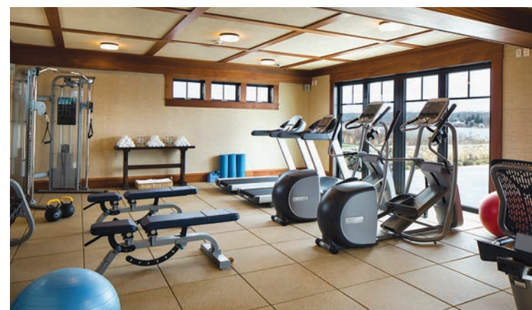
FITNESS CENTER, WEEKAPAUG INN